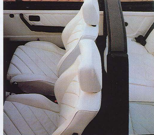
Optional boutique leather interior

would expect from a German road sedan. The seats are richly upholstered, fully reclining and body contoured. The rear window is made of glass, not plastic, and includes an electric defroster. Noise dampening cut-pile carpeting lets you enjoy the deluxe AM/FM