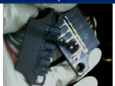
Without airbag: Skip to Step 5.

With airbag: Locate the airbag controller connection below the relay panel and disconnect the two halves of the connector.