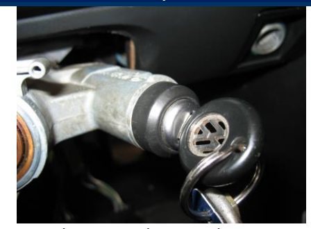
Put the ignition key into the ignition lock/switch cylinder and put in "on" position.