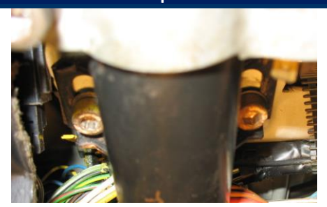
Remove the upper steering column cover. This may require <u>loosening</u> the 4 steering column Allen screws so that you can push down a bit to free the upper cover.