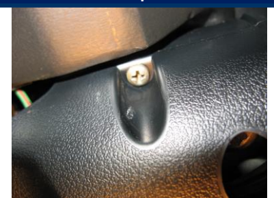
Using Phillips screwdriver, remove the two steering column cover screws, and remove lower cover.