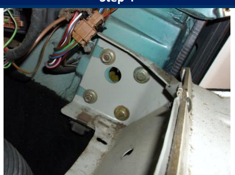
With airbag: Remove or lower the kneebar. Please download <u>http://www.cabby-</u> <u>info.com/Files/DashRemoval.pdf</u> and go to page 5 for complete instructions.