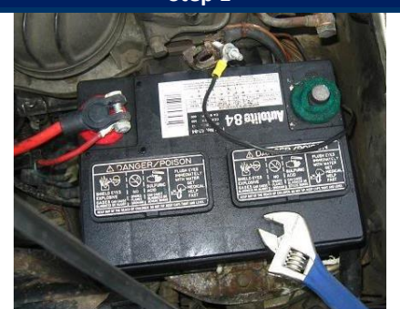
Using 10mm wrench, disconnect battery negative terminal.