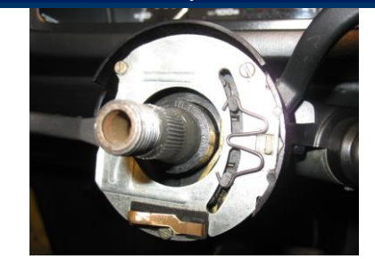
Using flathead screwdriver, remove the 3 retaining screws for the turn and wiper stalks. Remove the two stalks.