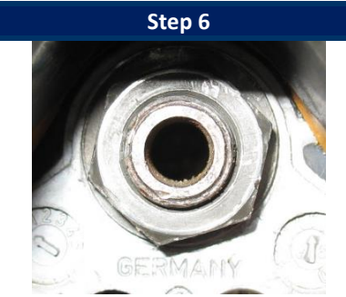
Using 24mm socket wrench, remove steering wheel retaining nut but keep nearby.

With airbag: Using a T30 Torx wrench, undo the two screws on the back side of the steering wheel and disconnect the electrical connector. Remove airbag.