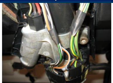
Disconnect all electrical connectors on steering column: ignition switch, turn signal, wash/wipe. Disconnect cruise control*, if installed.