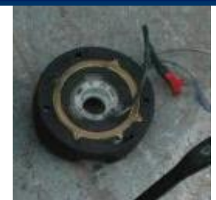
Without airbag: Skip to step 9.

With airbag: Remove clock spring; simply let it dangle off to the side, if desired.